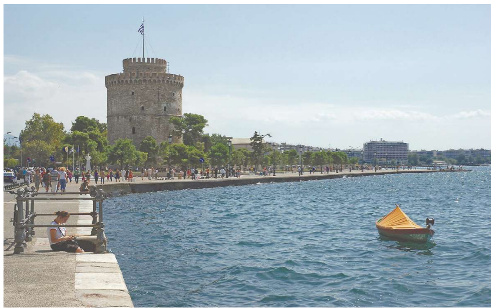
Thessaloniki, Greece's second-largest city, will host its 90th namesake international fair, featuring Japan as the Honored Country.

In 2026, economy and trade are emerging as key drivers of closer relations