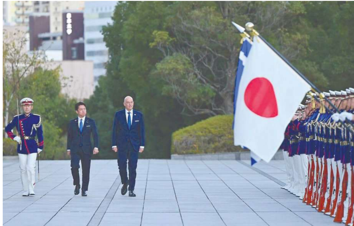
Defense Minister Shinjiro Koizumi escorts his Greek counterpart, Nikos Dendias, past an honor guard on Dec. 4, 2025, in Tokyo.

between our countries, following an upward trend in our bilateral trade balance. The fields of tourism, energy and shipping, as our countries have some of the biggest merchant maritime fleets worldwide, bear a particular significance, as well as the potential for growth in bilateral cooperation.